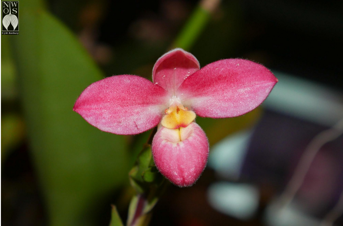
Phrag. Inca Fire 'Crimson Queen' - Yoshi Nagamatsu