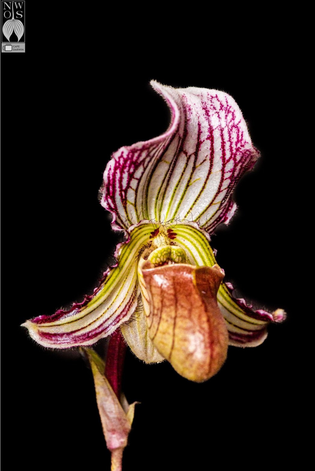
Paphiopedilum fairrieianum