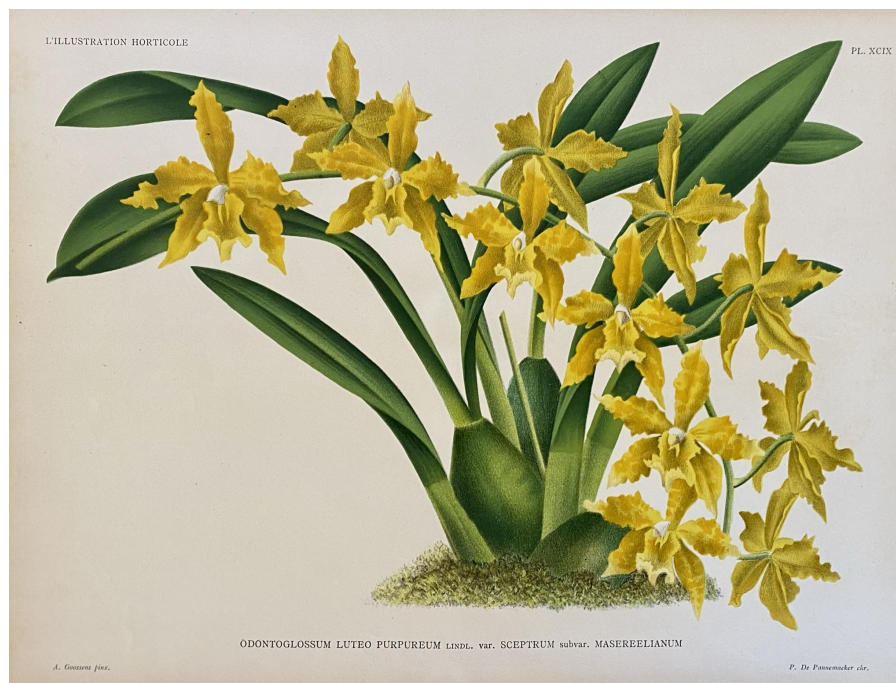
Odontoglossum Luteo-purpureum var. sceptrum 'Masereelianum'