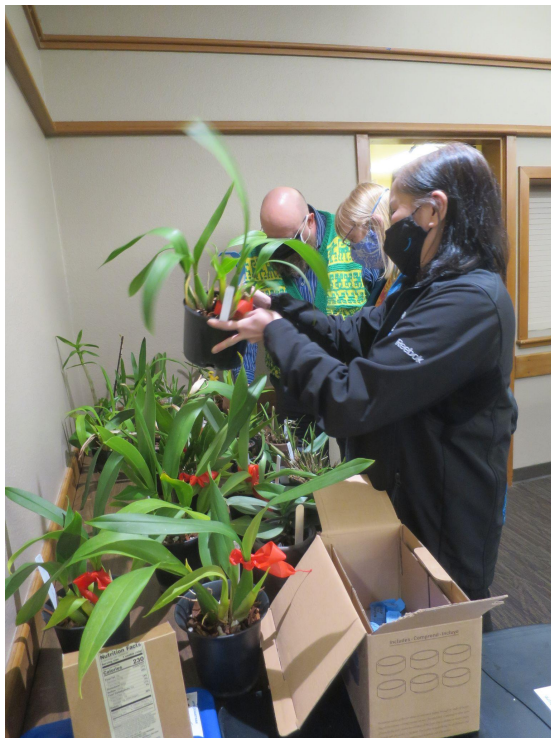
Inspecting the raffle plants