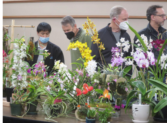
Admiring the Plant Table