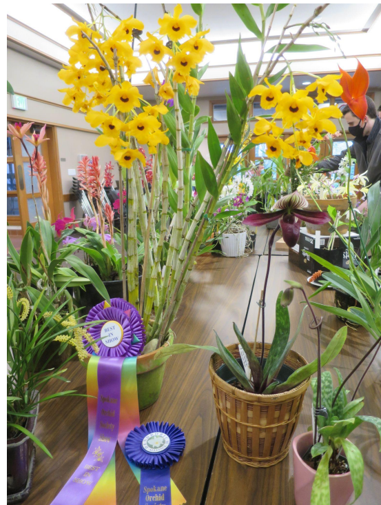
Dendrobium is Best in Show at Spokane OS, Grantham