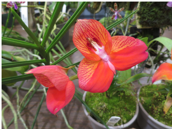
Disa uniflora

Here are several selected photos of April's Plant Table from the online gallery .