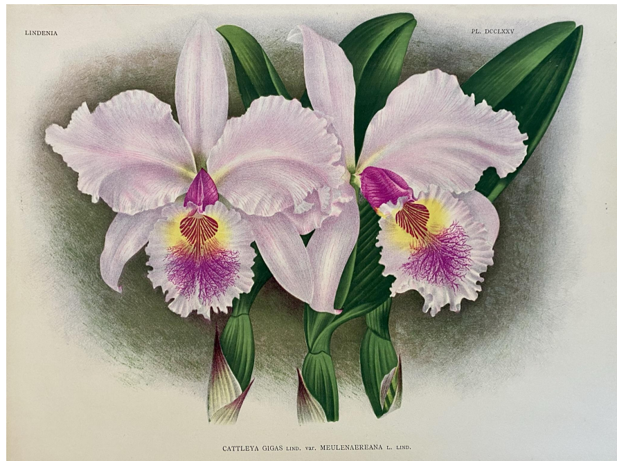
Cattleya gigas 'Meulenaereana'