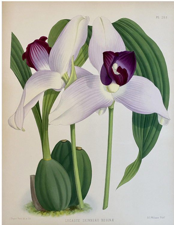
Lycaste skinnerii 'Reginae'