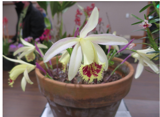
Pleione confusa 'Golden Gate' , Gordon Cromwell