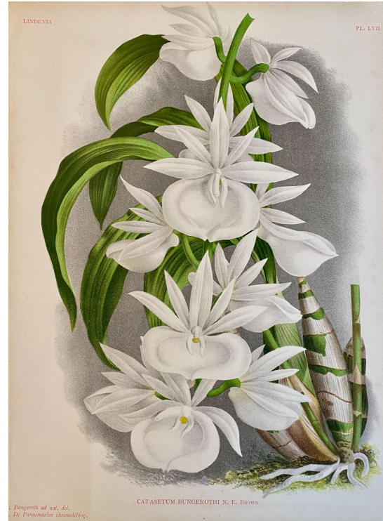
Catasetum pileatum alba