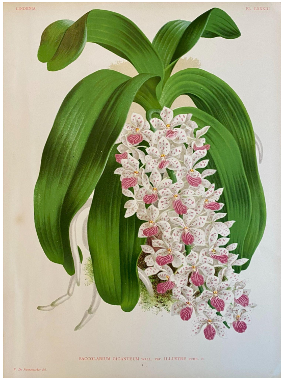
Rhynchostylis gigantea 'Illustre'