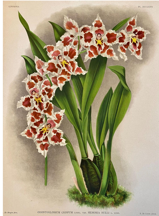
Odontoglossum crispum 'Memoria Bulli'