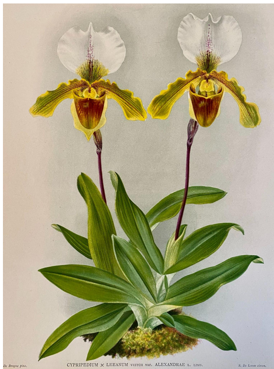
Paphiopedilum Leeanum 'Alexandrae'