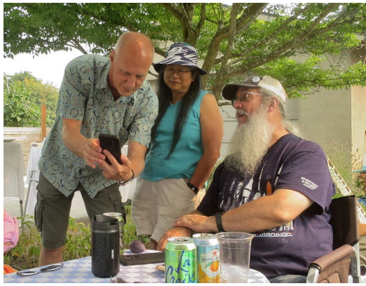
Hey guys, check this out