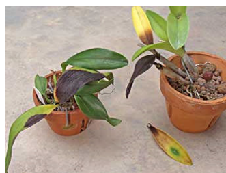
black rot (fungus)

Got yellow or crinkled leaves? Bring them to the meeting. Got spots, bugs, shriveled pseudobulbs? Bring 'em in. Got brown dry roots, unruly roots, mushy roots, or no roots? Bring your plant to the meeting so our many experienced members with their combined expertise can have a look. They can usually diagnose most issues and provide good advice on how to cure or fix the problem. But for the most extreme cases, we will offer a Free compost service :-). Any plants that are diseased or have a bug problem should be in a plastic bag to isolate them.