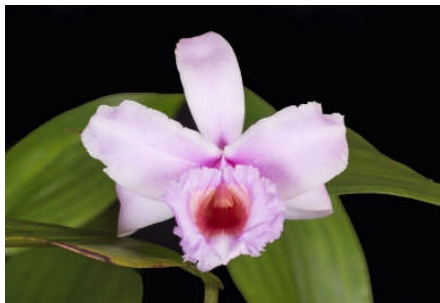
Sobralia decora 'Jaxon' AM/AOS

Remember if you become an American Orchid Society member, you have considerably more resources at your disposal making growing orchids even more enjoyable and successful. This includes Digital Access To Over 350+ past issues of ORCHIDS magazine extending back to 1932! Also featured in Orchids Magazine is a 16-page award gallery of breath taking pictures of recently awarded orchids.