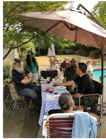
Orchid friends at our picnic