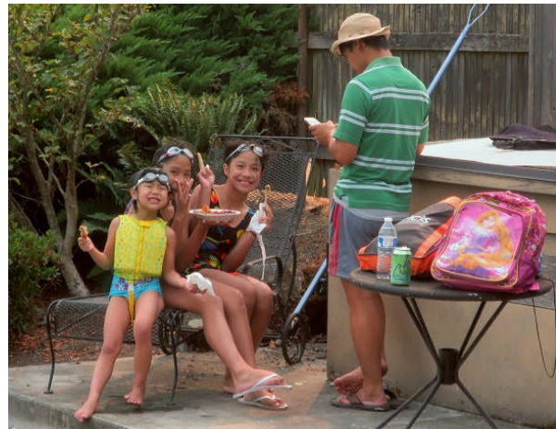
Enjoying some of the picnic food