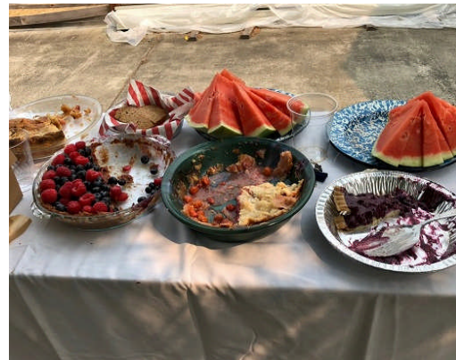
Oh yeah, gotta love those homemade pies and the sweetest watermelon ever