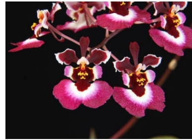
Oncidium Pink Panther 'Elizabeth Grace' AM/AOS