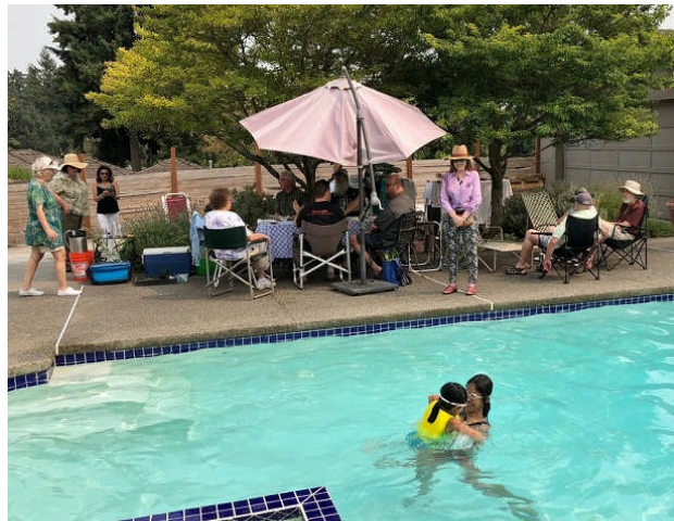
Watching the water action