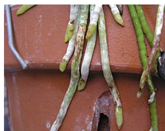
slugs and snails