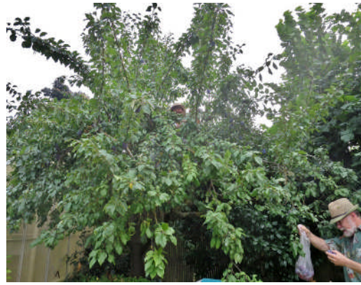
Mike's gathering plums in the lower right, but look closer in the center of the tree...