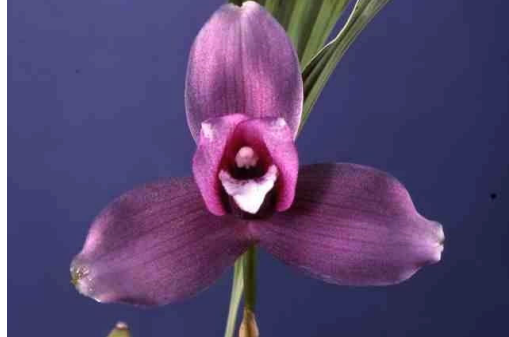
Lycaste Wyld Unicorn 'Unicorn Rose' HCC/AOS Photographer: Unknown

Sometimes there is magic at the opening of a new flower, as if suddenly a legendary creature has appeared in our presence and allowed us access to its glories and mysteries. Such was certainly the case when Lycaste Wyld Unicorn 'Unicorn Rose' HCC/AOS bloomed for the first time. Photographer: Unknown.