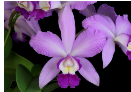
Cattleya Big Dipper 'Mizar' HCC/AOS