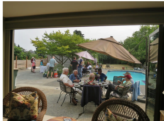
Enjoying good company in front of the great open wall of the house