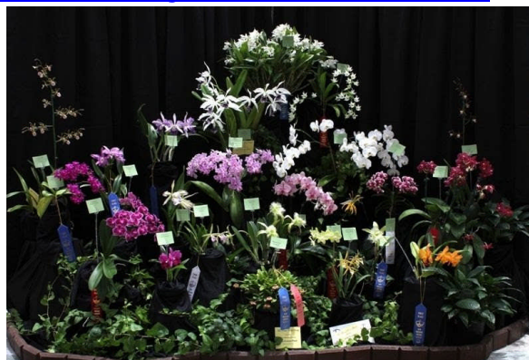
Show Trophy awarded to the Mobile Are Orchid Society

https://register.gotowebinar.com/register/4152830511639542785