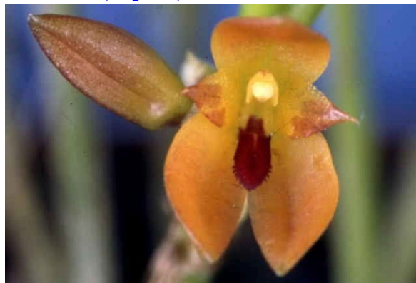
Pleurothallis modesta 'Free Spirit' CBR/AOS; Photographer: Max Thompson

https://register.gotowebinar.com/register/9119068349037565443