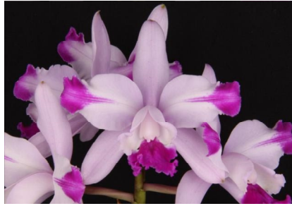
Cattleya intermedia (aquinii) 'SVO Star Burst' AM/AOS; Photographer: Arthur Pinkers

Note: After registering, you will receive a confirmation email containing information about joining the webinar.