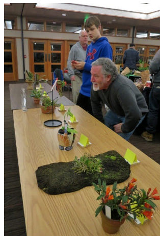
taking a closer look at all the candidates

The Rebecca T. Northen Miniature Orchid Trophy is awarded to the best blooming plant that is 6 inches or less in height, excluding the bloom spike.