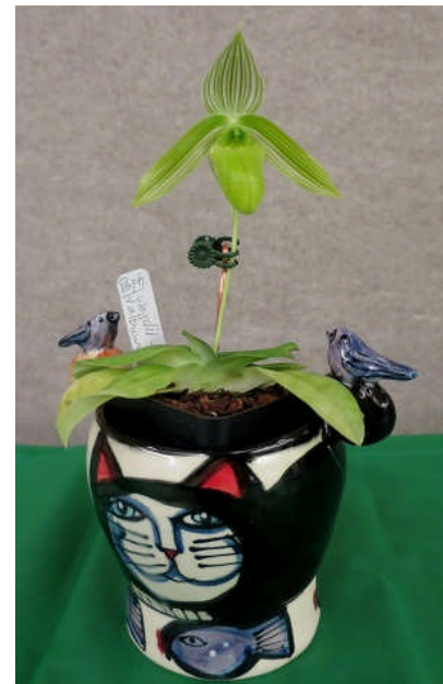
Paphiopedalum wardii v. album