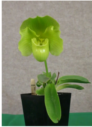
Paph. (Icy Icy Wind 'White Satin' x Pacific Shamrock 'Imagination')