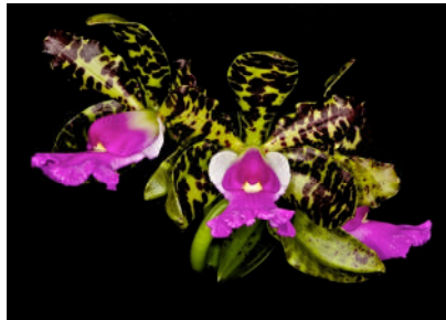
Cattleya aclandiae 'Waldor's Big Tom' AM/AOS; Photographer: Maurice Maretti