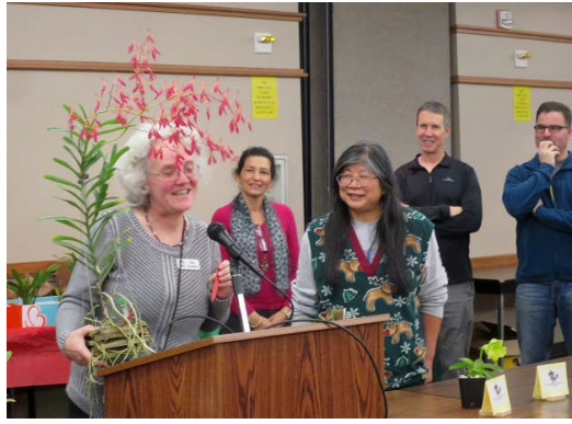
Ellen announces our winner