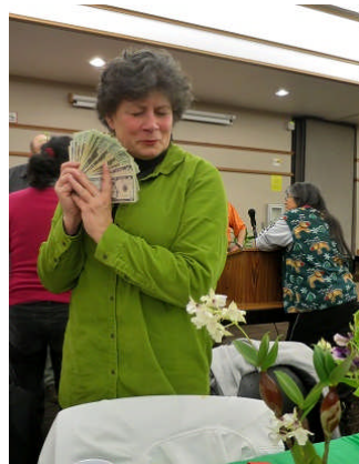
Oh darn, what was I thinking?