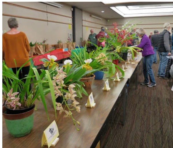
Schoenfeld table of contestants

The Schoenfeld Trophy is awarded to the best blooming plant of any size.