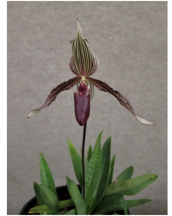
Paph. A de Lairesse 'Hidden Dragon'