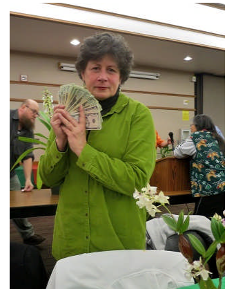
As your treasurer, I'll be depositing this in the society's account tomorrow.