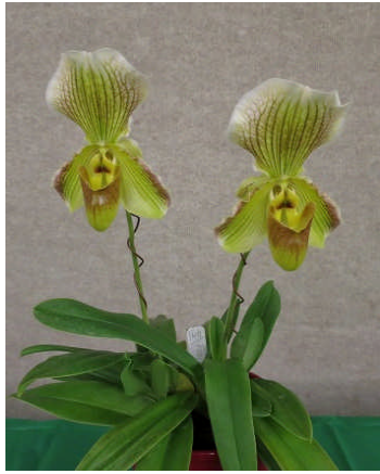
Paph. Fairly Sauced