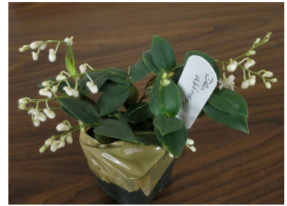
Den. abberans, one of our Legion of Bloom plants