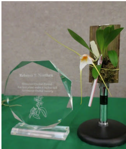
Masdevallia constricta with trophy