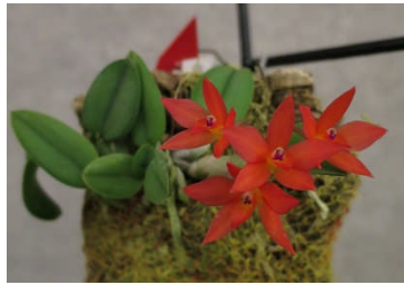
Sophronitis cernua 'Bahia'