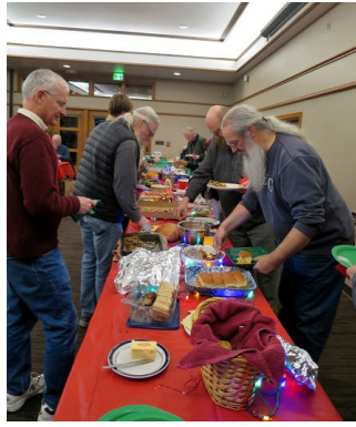
Plenty for everyone