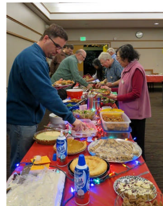
Lots to choose from