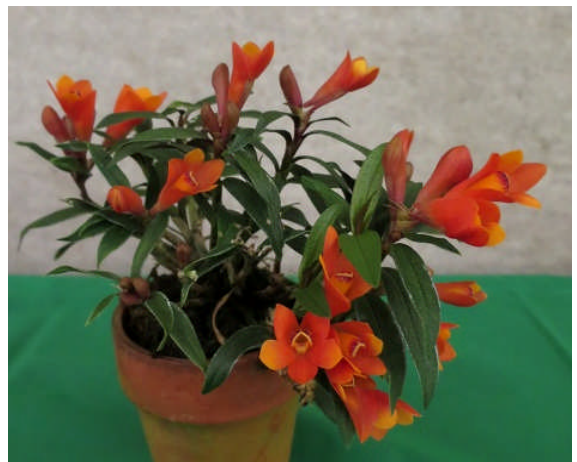
Denrobium Illusion 'Red Type'