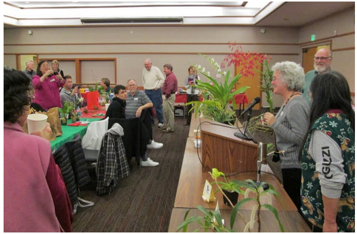
and this year's winner is