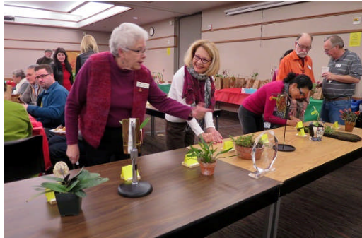
Discussing the merits