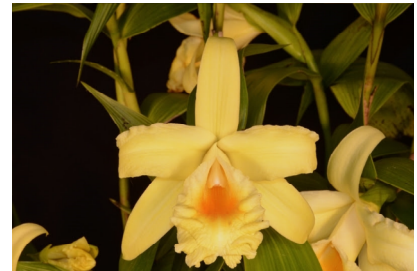
Sobralia xantholeuca 'Ohsuka' HCC/AOS