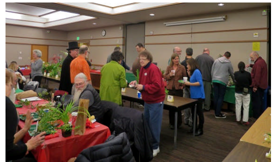
Gift plants, visiting & voting

The Rebecca T. Northen Miniature Orchid Trophy is awarded to the best blooming plant that is 6 inches or less in height, excluding the bloom spike.