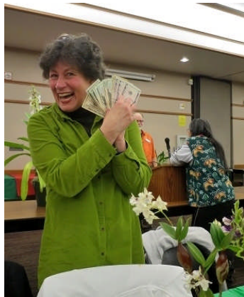
Whoo Hoo! Girl's gonna have fun!