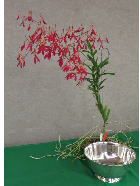
Renanthera imschootiana with trophy