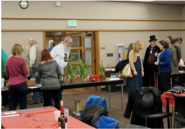
Chatting and checking out the Legion of Bloom plants