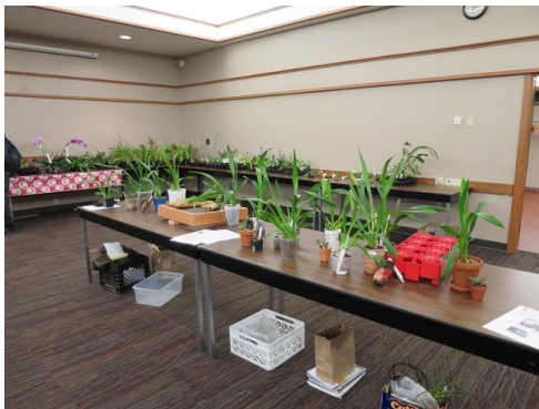
Legion of Bloom plants