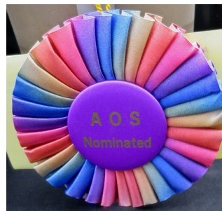
AOS Nominated show ribbon

This is an excellent opportunity to learn what judges look for in a superior orchid plant. Make sure to read more about it in the article below.