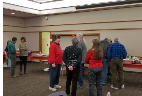
Lots of visiting amongst the members