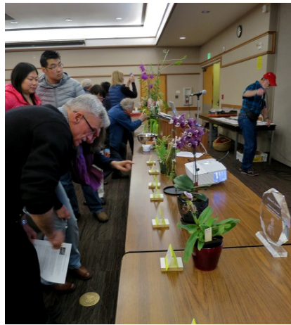
You have to look closely at the little ones

Entries for the Rebecca T. Northen Miniature Orchid Trophy, which is awarded to the best blooming plant that is 6 inches or less in height, excluding the bloom spike: