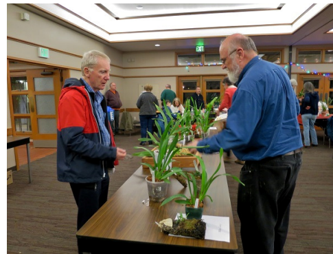
Comparing the same LOB plants and how they are growing under different peoples' conditions