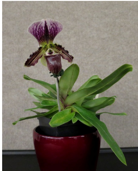
Paph. fairrieianum 'A' x Paph. spicerianum 'Bostock's'