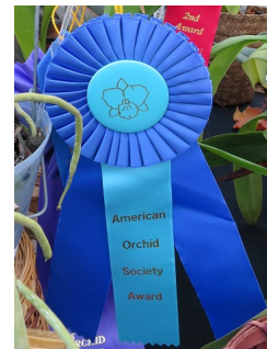
AOS award show ribbon