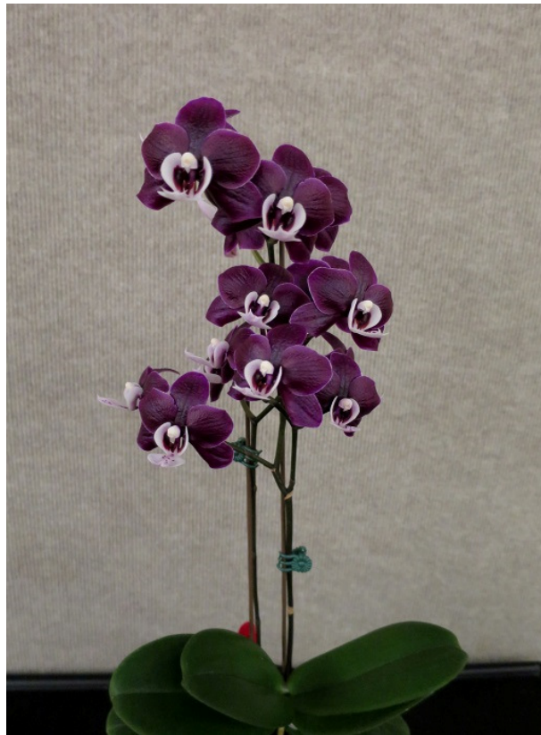
Phalaenopsis Kaoda Twinkle 'K506'