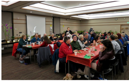
Enjoying dinner and good company