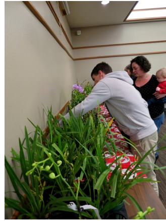
Selecting the perfect gift plant