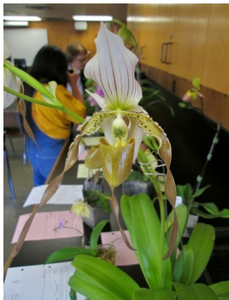
Paphiopedilum ready for Judges review