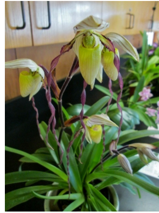
Another plant for review