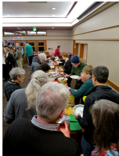
Who can resist this wonderful spread?