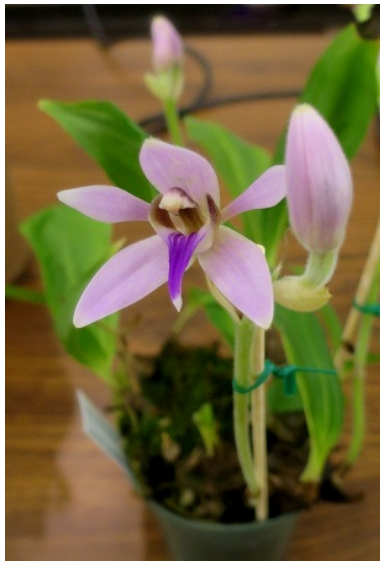
Ancistrochilus rothschildianus - Tied for 2nd Place