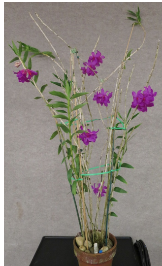
Den. glomeratum - 3rd Place Winner