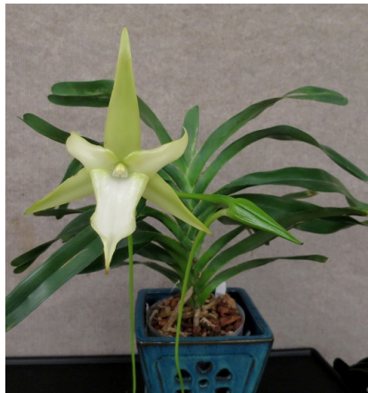
Angraecum sesquipedale - 2nd Place Winner