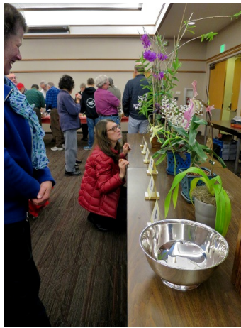
Looking for the best