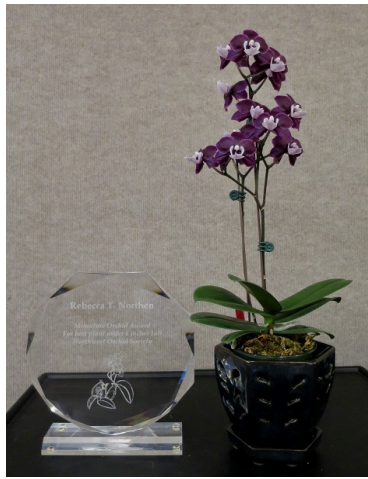
Northern Trophy with Winner