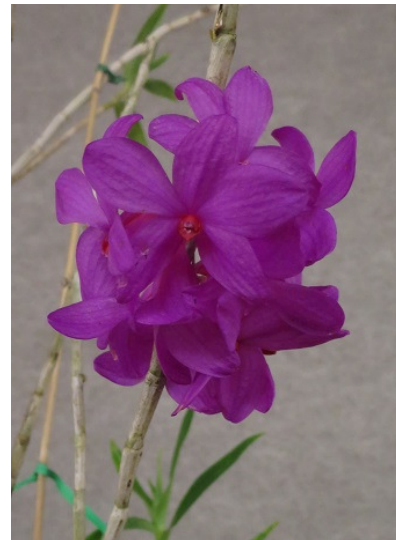
Dendrobium glomeratum closeup