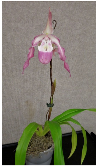
Phrag. QF Naukana Kealoaha (longifolium var. gracile x Incan Treasure)