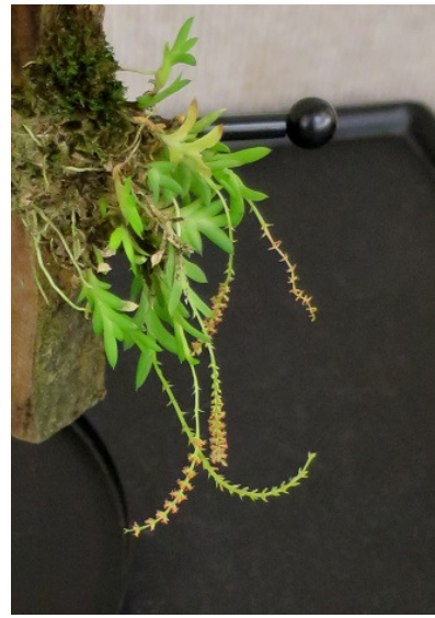
Oberonia japonica - Tied for 2nd Place