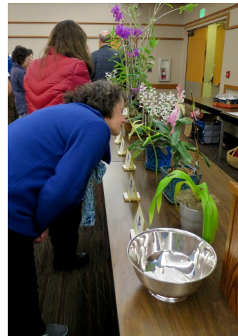
Scrutinizing all the blooms