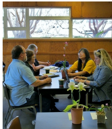
AOS Judging team scoring a plant