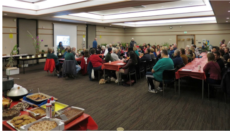
It's nice to see a full room of interested orchid enthusiasts