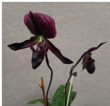
Paph. Odette's Fantasy