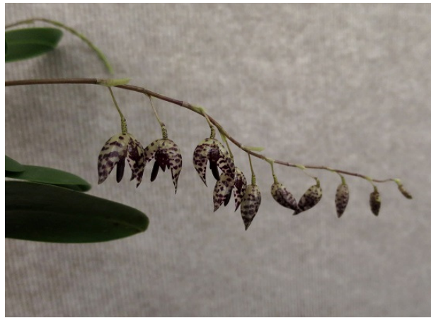
Pleurothallis restripiodes closeup