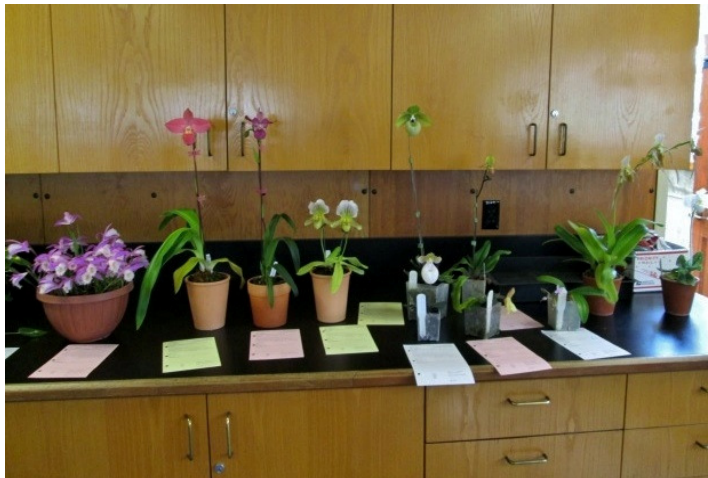
Orchids at the AOS judging