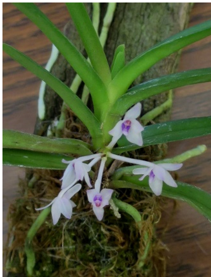
Ascocentrum pusillum - 3rd Place Winner