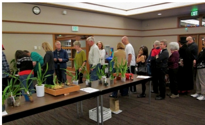
Lining up for our gift plants