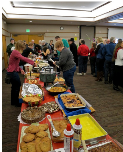
Pot luck dinner