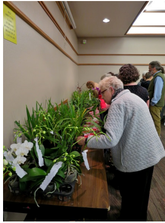
Choosing a Holiday plant