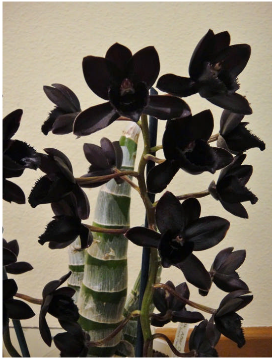
Fredclarkeara After Dark 'SVO Black Pearl' FCC/AOS