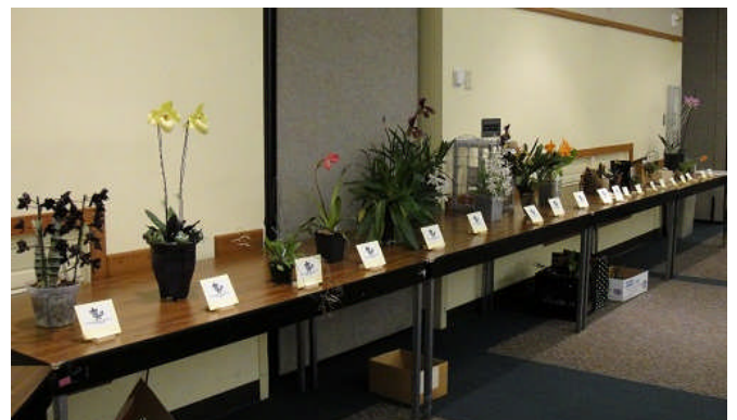
Contestants for both trophies