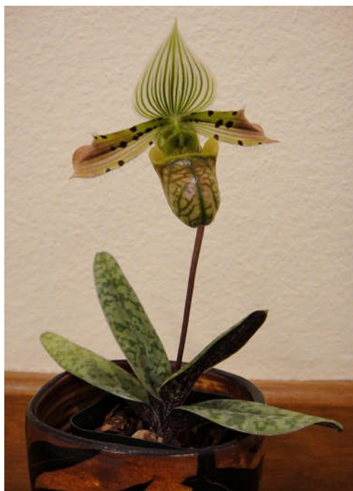
Paph. Cahaba Venus with beautiful markings.