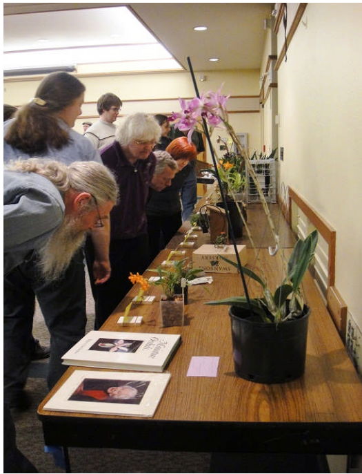
Taking a close look at the contestants before voting.

During breaks, members reviewed the contestants for the Schoenfeld and Northen Trophies. Each person voted for their favorite orchid in both categories.