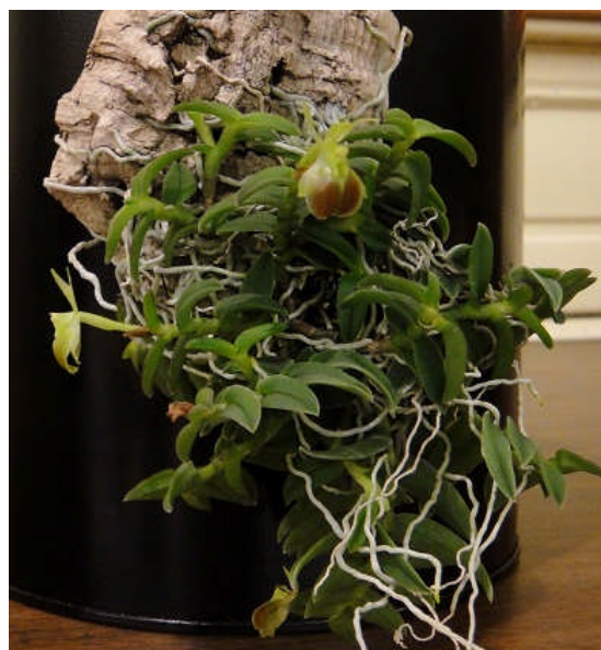
Epidendrum peperomia , cute green and red flowers on a mat of green foliage.