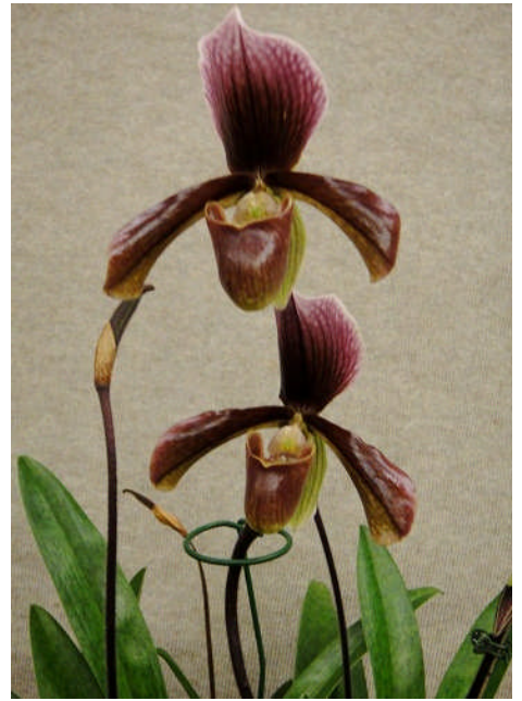
Paph. Earl of Chester

Deep royal purple exhibited in these two fine Paphiopedalums.