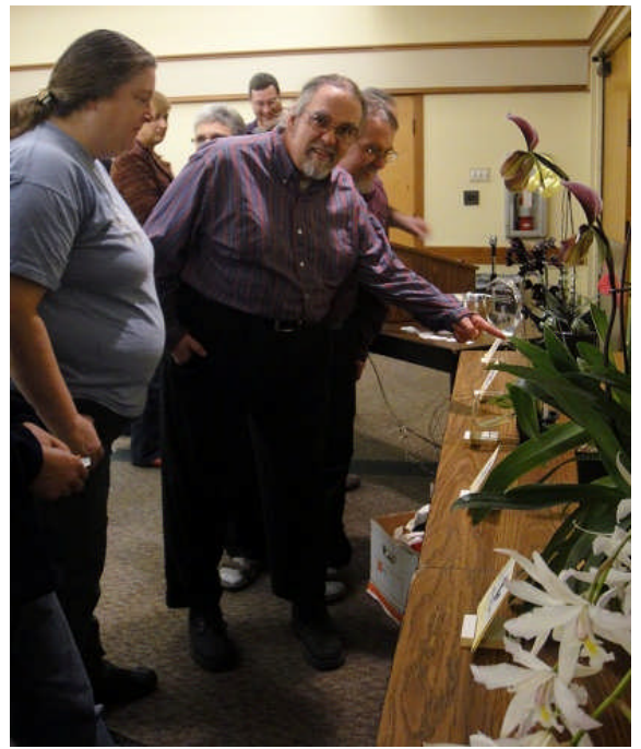
Are we predicting the winner?

The Schoenfeld Trophy is awarded to the best blooming plant of any size.