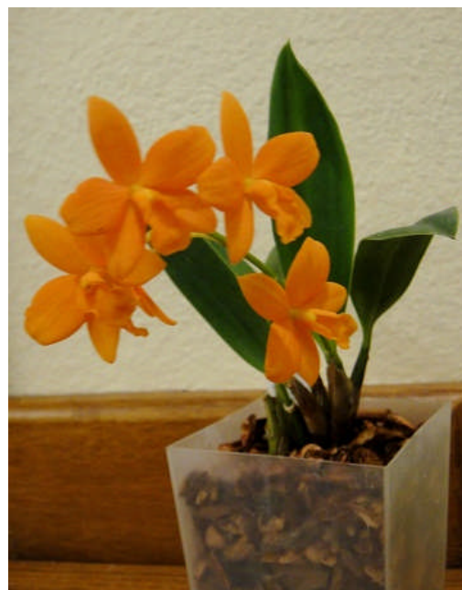
Cattleychea Orange Stardust 'Masumi'