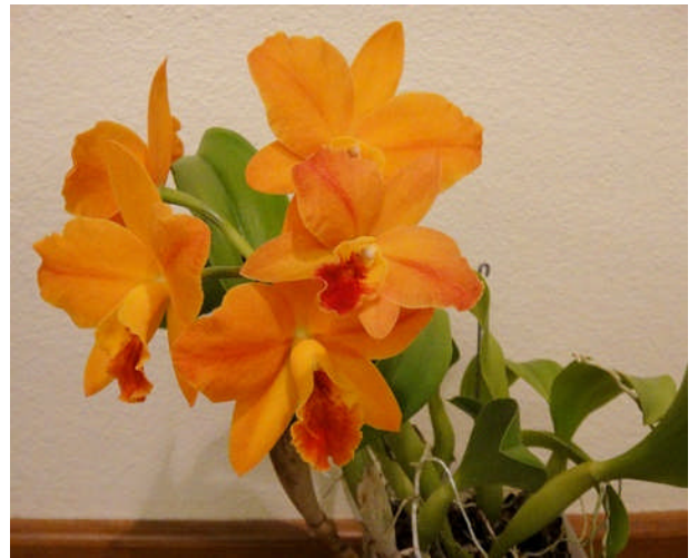
Slc. Hazel Boyd 'Apricot Glow' AM-CCM/AOS