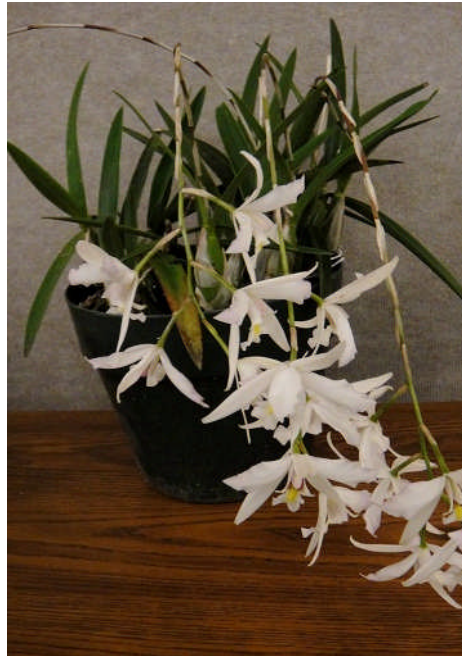
Laelia Finckeniana with graceful cascading inflorescences.

And now here are the contestants for the Schoenfeld Trophy: