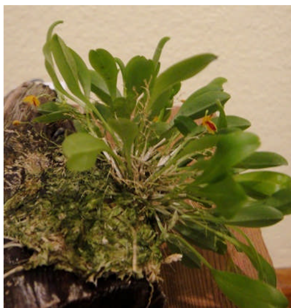
Pleurothallis rubella (modesta)