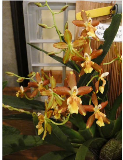
Oncidium Chaculatum 'Golden Pacific' with colors that can only be described as delicious.