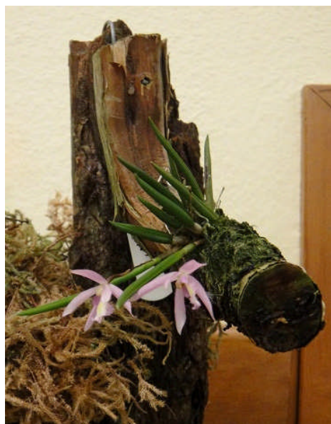
Leptotes harrypeperomia , delightful pink and white flowers on needle-like leaves.

Here are the contestants for the Rebecca T. Northen Trophy: