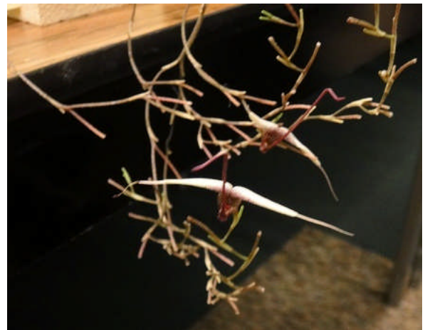
two images of the tough-to-photograph Scaphosepalum gibberosum , a wonderfully unique and striking flower.