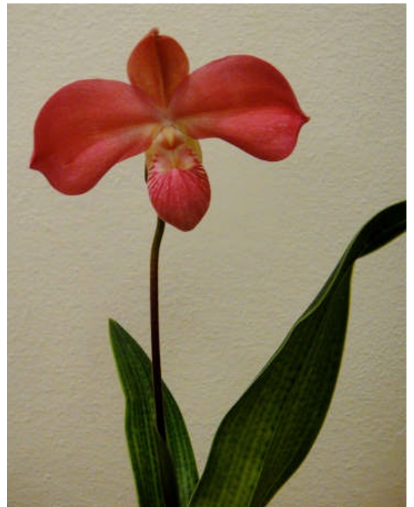
Luscious color on Phrag. Fritz Schomburg (kovachii x besseae) on another well-grown plant.