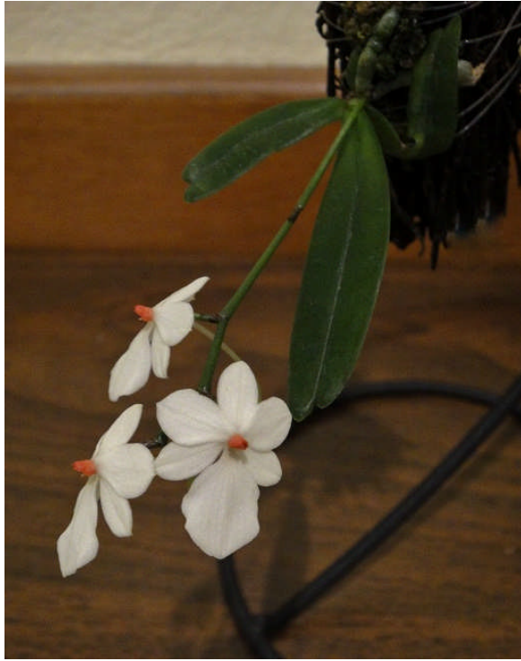
Aerangis luteo-alba var. rhodosticta