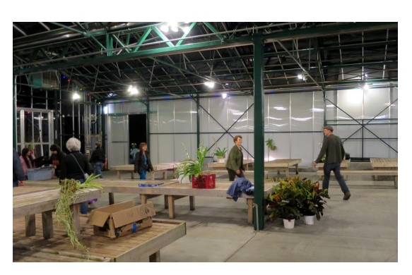
Down to the last few plants