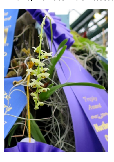
Miniature: Dendrobium schneiderae var. major Ellen Covey - Northwest Society