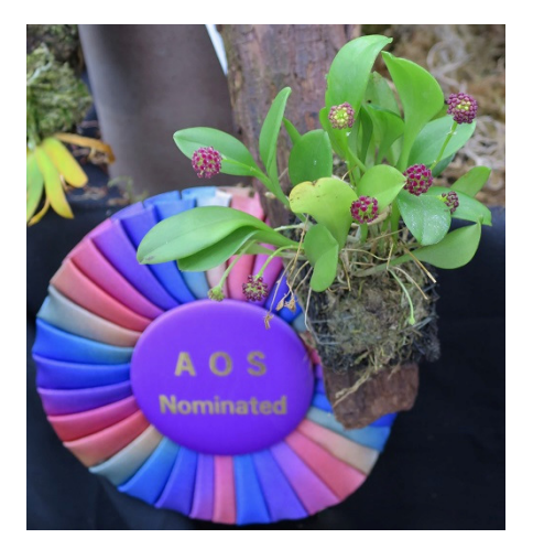
Another plant was AOS Nominated: Platystele umbellata. Owner SeattleOrchid.com