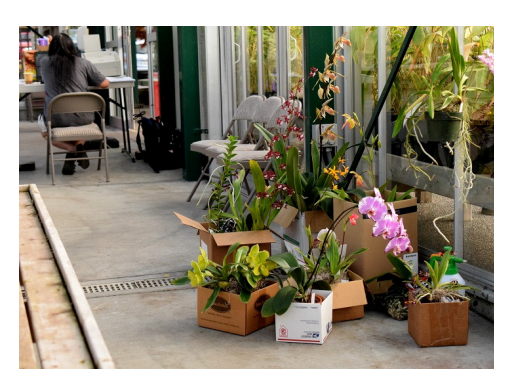
Plants ready for setup