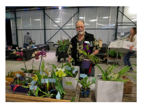
Happy after an orchid-filled weekend