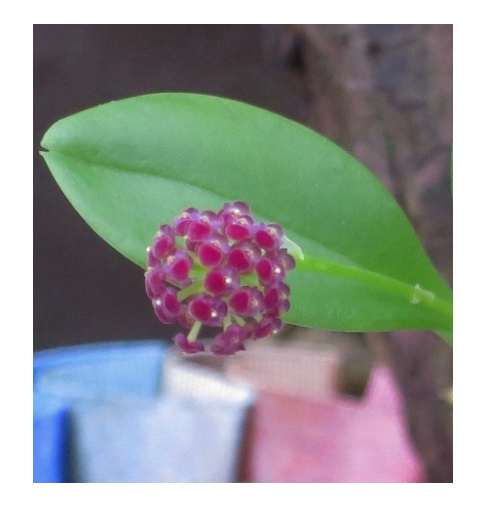
closeup of its very interesting flower clusters