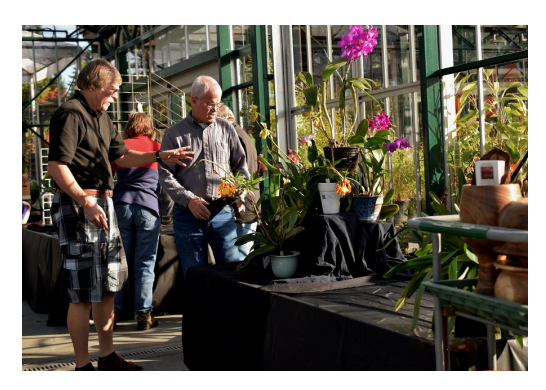
working on an artistic placement