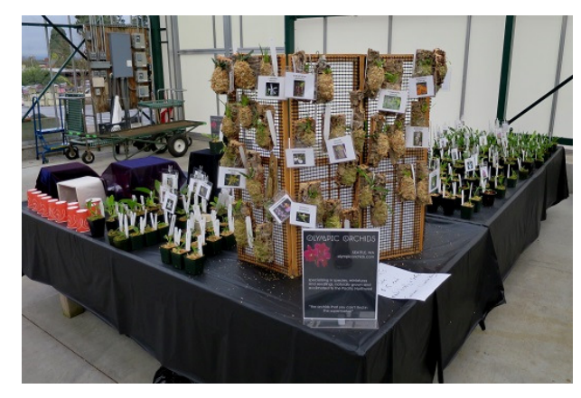
Olympic Orchids sales table