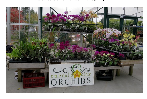
Emerald City Orchids Sales area