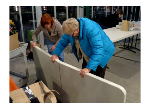
Looks a lot like the setup, only now the tables fold back up