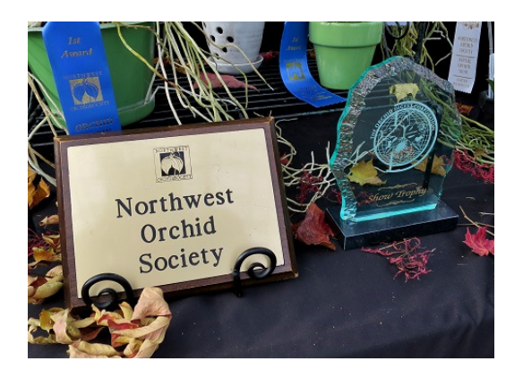
and the NWOS display won the Orchid Digest Corporation (ODC) Trophy