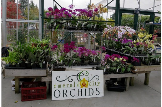
Emerald City Orchids display