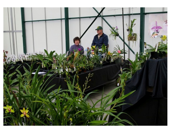
Lucky Girl Orchids