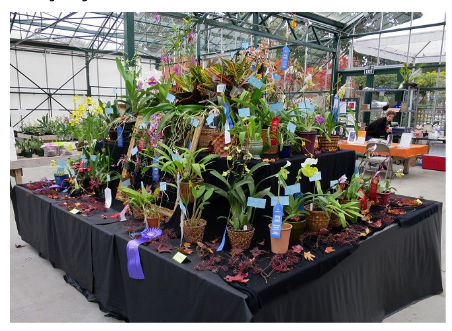
NWOS Display back side