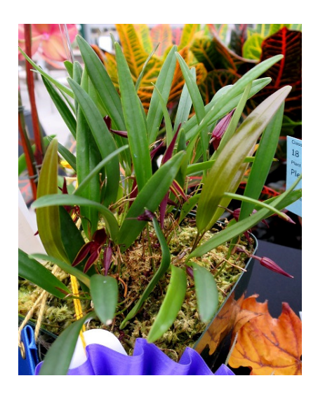
Pleurothallid Alliance: Pleurothallis allenii 'Fichtenfels' Ellen Covey - Northwest Society