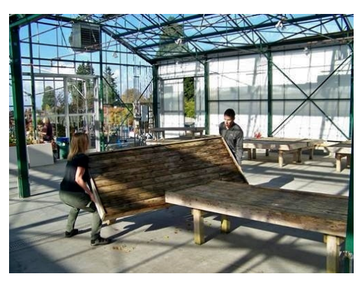
Lori and Steve are a great help moving the HEAVY wood tables into position