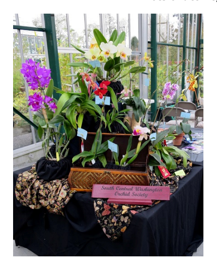
So Central WA OS display