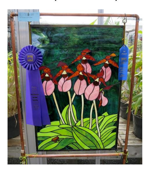
Presidents Choice: Cypripedium acaule in Glass Abigail Chang - Northwest Society