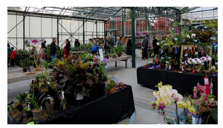
lots of activity