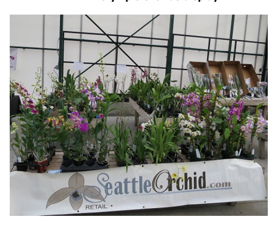
SeattleOrchid.com plants for sale