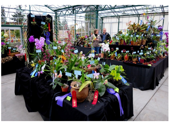
Looking at all the beauties