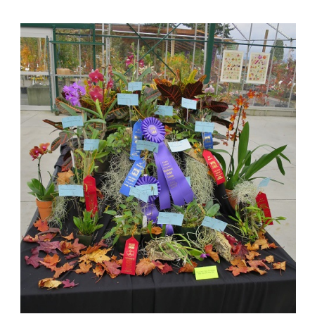
Olympic Orchids display