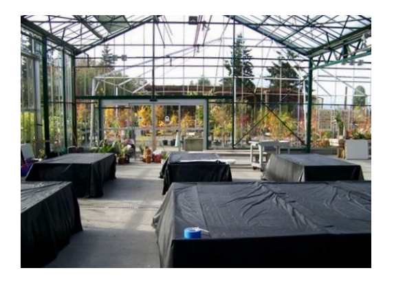
Finally...the display area is ready for plants