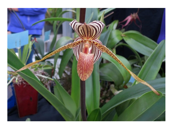
Paph. Bel Royal