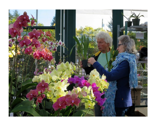
Too many to choose from