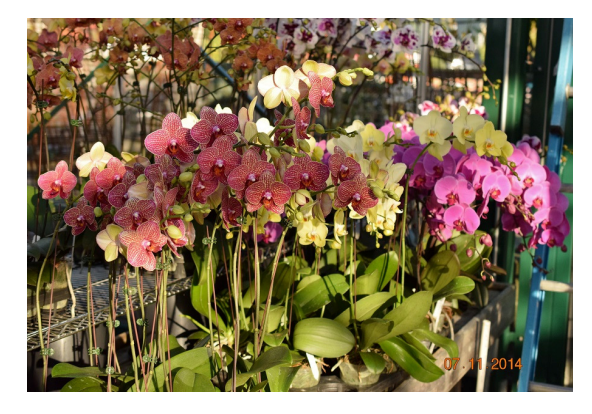
lovely sprays of color