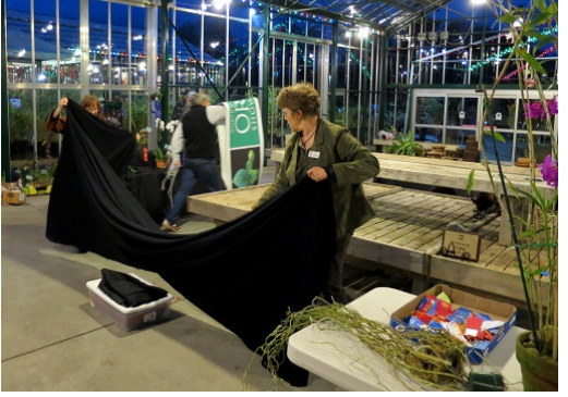
Big sheets need 2 people to wrestle into shape