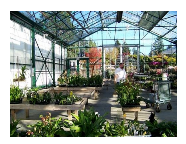
The Sales Area vendors are beginning to trickle in