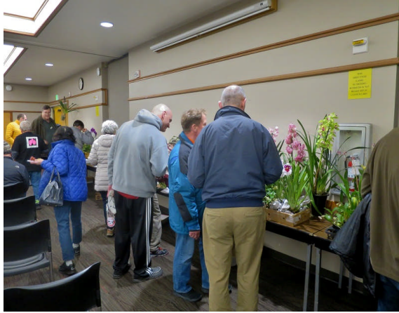
checking out the items