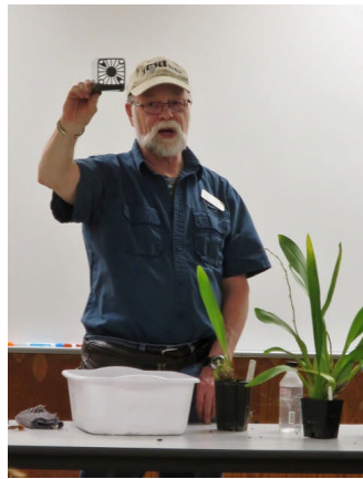
Pot with lots of drainage