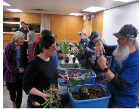
explaining, examining, demonstrating, potting