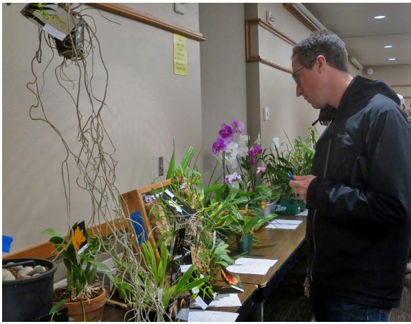
which one do I want?