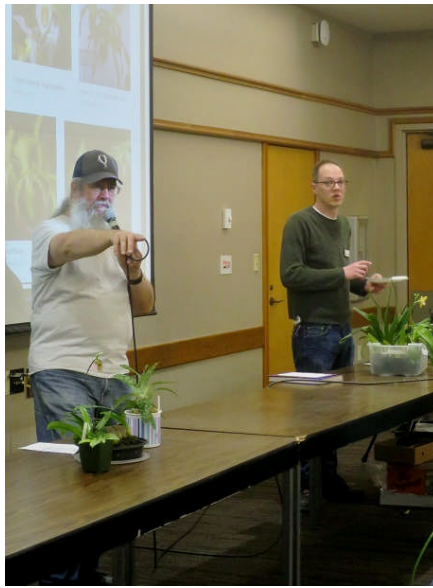
You've got the bid