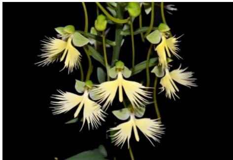
Habenaria Light Wings 'Matt's Lemon Gem'

https://register.gotowebinar.com/register/4032749560393528833