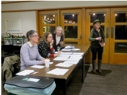
Keeping track of the bids