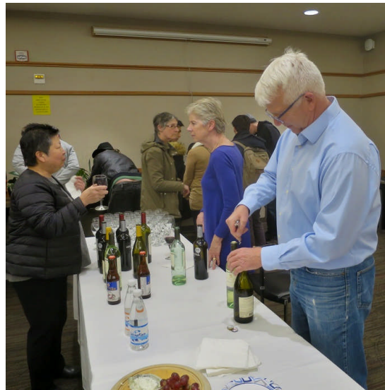
wine and cheese