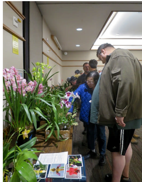
plants up for bid