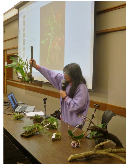
Abby - Orchid Basics - mounting orchids