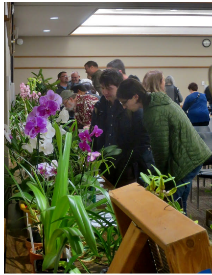
great selection of plants