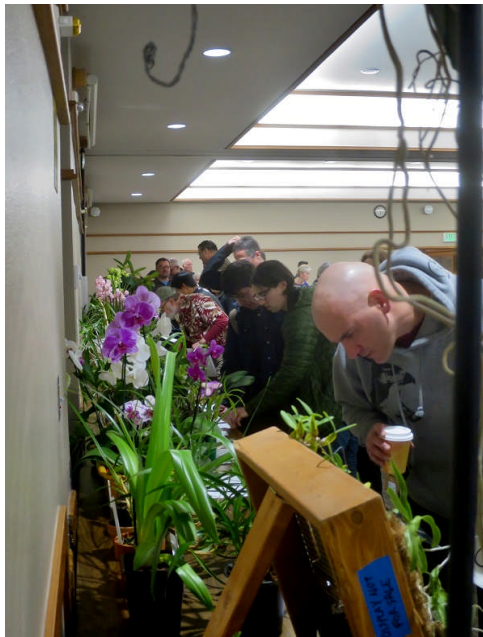
Looking over the Auction items