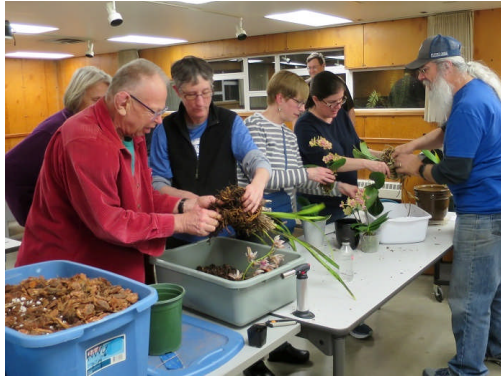
cleaning old media off the roots