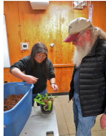
looks so much better