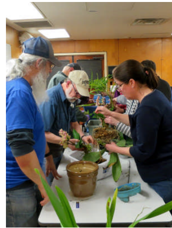
Many hands, many repotted plants