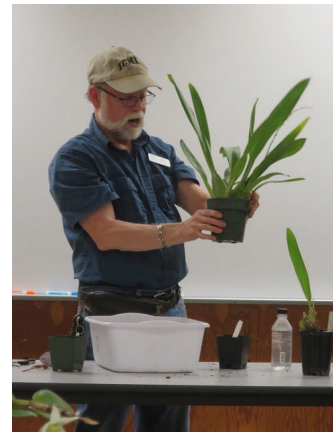
how to select the right sized pot