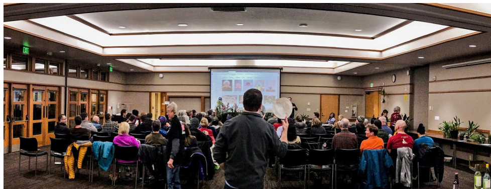
Andy bids from the back