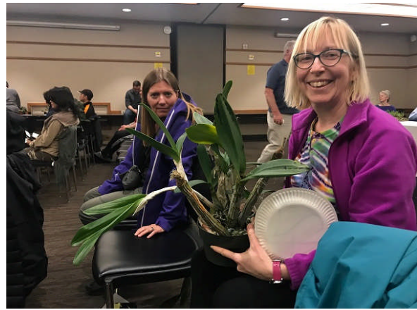
Happy with her new plant, as were we all