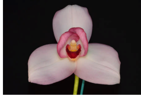
Lycaste Spring Present 'Redwood' AM/AOS; Photographer: Chaunie Langland