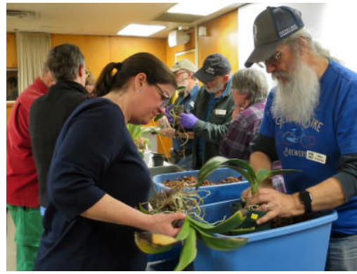
after cleanup, getting a new pot