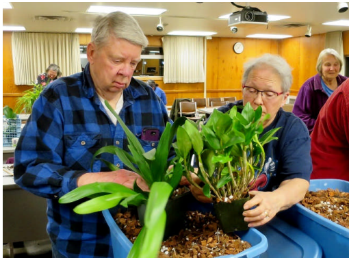
packing new media into the pot