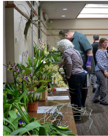
Of course we have to review the plant table to decide which ones we'd like to bid on