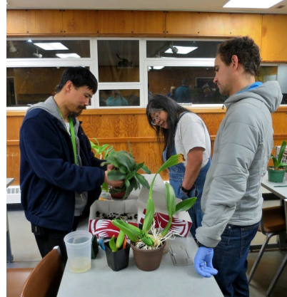
sizing up the plant and getting good advice