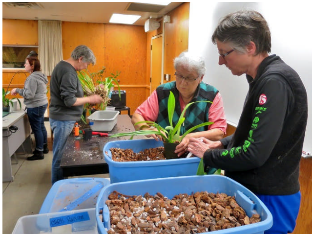
Pat helps by watching and guiding so that the plant is repotted with good technique