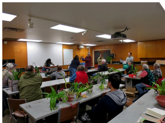
Room full of interested orchid growers