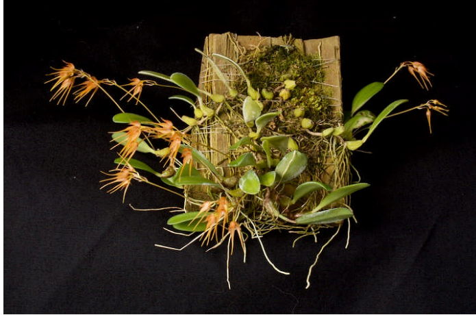
Bulbophyllum taiwanense 'Final Chapter' CCM/AOS