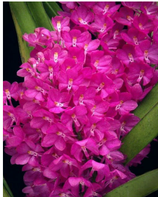
Good cultural practices that include regular fertilizing will produce well-flowered orchids, such as this Vanda ampullacea ( Ascocentrum ampullaceum ) Grower: Greg Allikas & Kathy Figiel.

◇ Bloom or blossom-booster formulas are high in phosphorus. Typically, high-phosphorus fertilizers are applied every other week for four to six applications the season before expected bloom. For winter-spring blooming orchids, bloom booster is usually applied in the autumn. Vandaceous hybrids and other orchids that bloom throughout the year can be given bloom booster every third or fourth fertilizing. An example of a bloom booster would be 10-30-20. Fertilizers used on orchids should contain little or no urea. This is because soil organisms must first convert the nitrogen in urea to a form useable by plants, and since orchids do not grow in soil, this conversion does not occur efficiently.