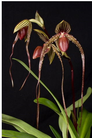
Paphiopedilum Prince Edward of York 'Cocoa' HCC/AOS