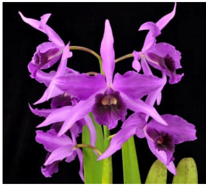
Cattleya purpurata (hort. var. rubra) 'Shoguns Fire' FCC/AOS