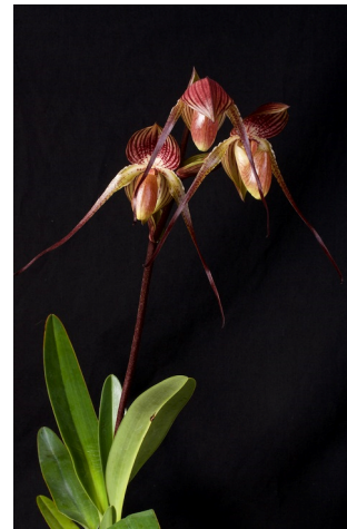
Paphiopedilum QF Kulani 'Cocoa' AM/AOS

HISTORY - Here are a few excerpts from an AOS Judges' Training article by Bergen Todd about the history of the Pacific Northwest Judging Center: