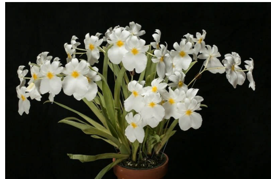
Miltoniopsis vexillaria var. alba 'Princess' CCM/AOS