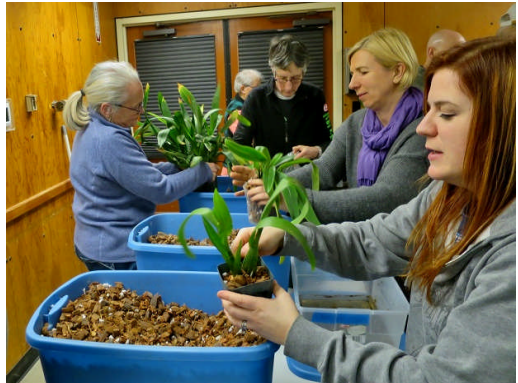
After a full evening of advice, everyone digs in now that they're confident in their new potting techniques