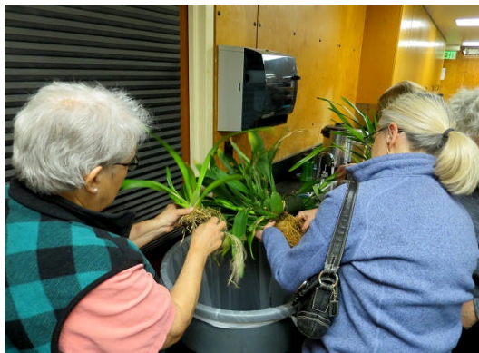
cleaning old media off the roots