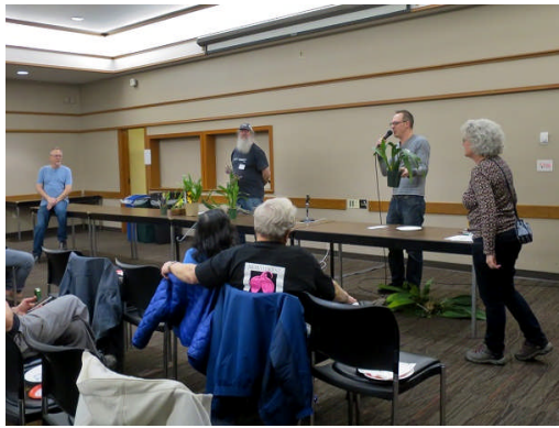
Auctioneers with plant runners AI and Ellen