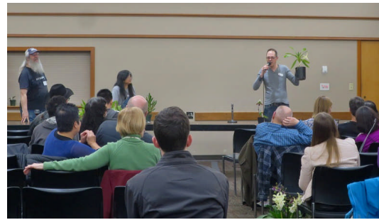
what am I bid