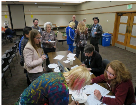
After a rousing event, we're still talking and comparing notes about our plants.