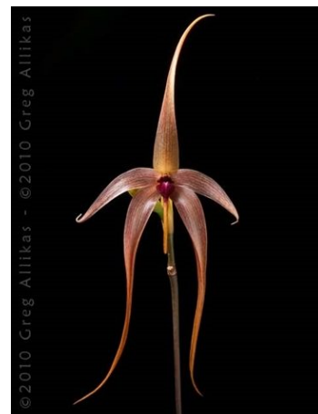
Bulbophyllum echinolabium 'Springwater' HCC/AOS; Photographer: Greg Allikas

https://register.gotowebinar.com/register/4407180542545159939