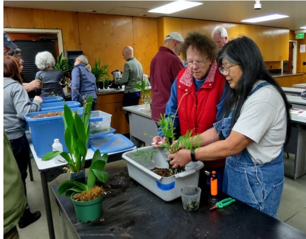
Do we divide or not?