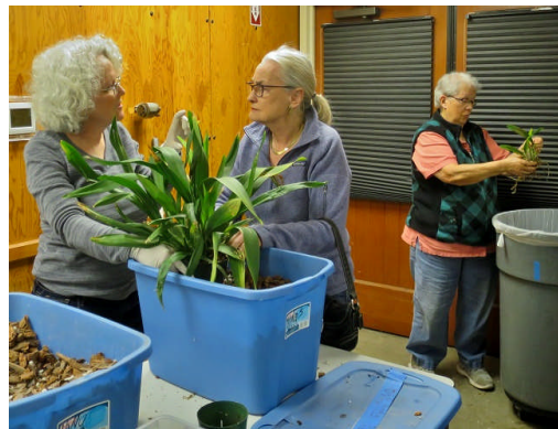
Ellen answers questions