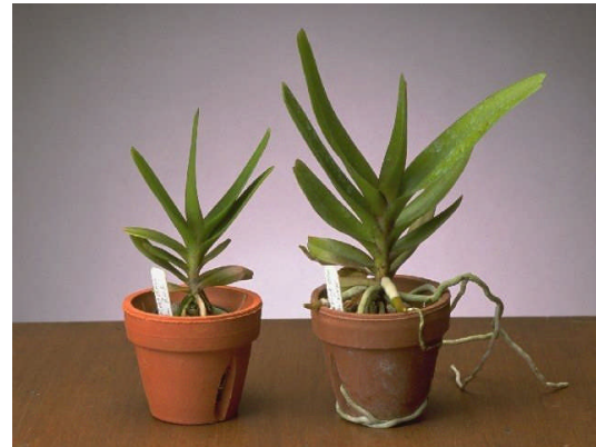
Vandaceous orchids that were under fertilized (left) and received adequate fertilizer (right).

APPLICATION How fertilizer is applied varies as much as orchids themselves. Typically, plants are fertilized once a week during spring and summer and every two weeks in the autumn and winter. Regardless of the fertilizer that you choose, most experienced growers use ½ the label-recommended strength. Remember, in nature epiphytic orchids' roots are exposed and the only nutrients they receive are from bird and animal droppings, decaying insects and detritus. The old saying about fertilizing orchids is: Feed them weekly weakly. Fertilizer is best applied in the morning on sunny days. For mounted orchids, or orchids with exposed roots, such as vandas in empty baskets, many growers routinely first water the plants and then follow with fertilizer a half hour later. The watering before fertilizing prepares the spongy velamen of the orchid roots to better utilize the fertilizer. Orchids in pots are usually not watered first but some growers have their own techniques.