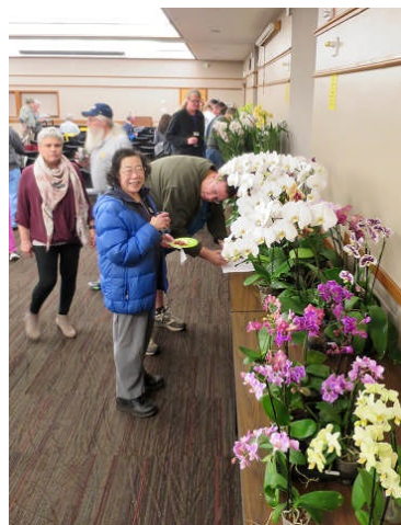
looking at the blooms