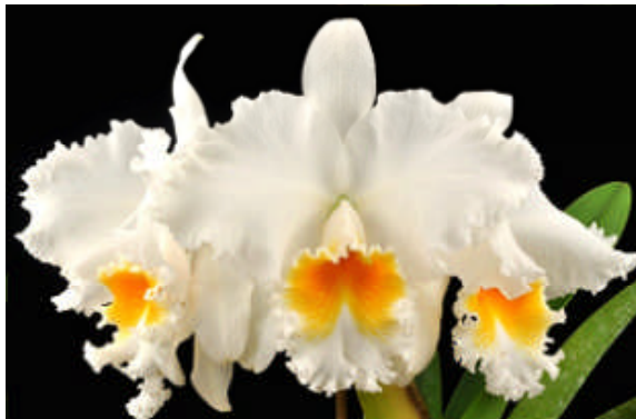
Rhyncholaeliocattleya Taida Eagle Eye 'White Angel' FCC/AOS