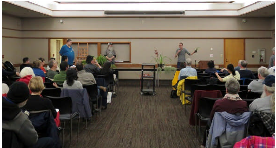
the auction in full swing