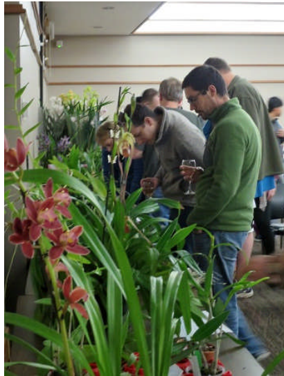
checking out the plants before we start