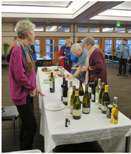
camaraderie before the bidding war begins