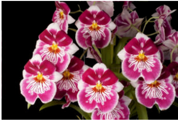
Miltoniopsis Bobbie Smiles 'Remember Me' HCC/AOS

ALSO FEATURED IN ORCHIDS MAGAZINE: 16-page award gallery of breathtaking pictures of recently awarded orchids.