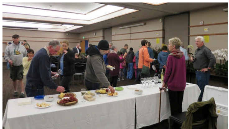
a great crowd attends our auction event