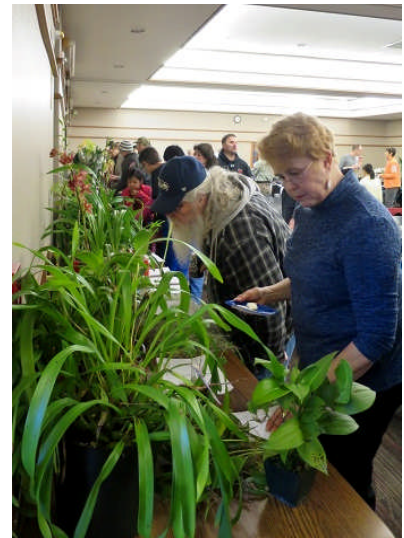
deciding what to bid on