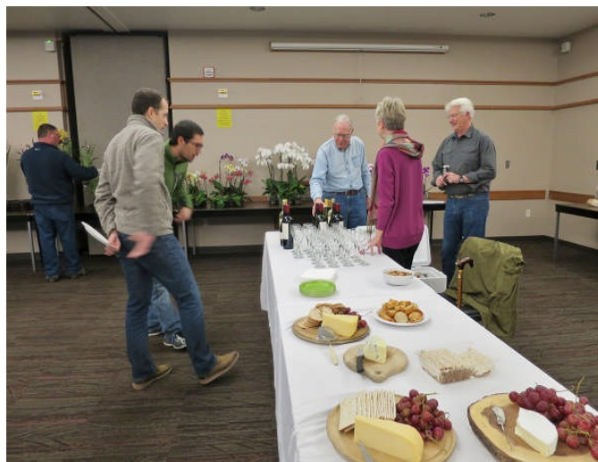
tasty wine and cheese spread