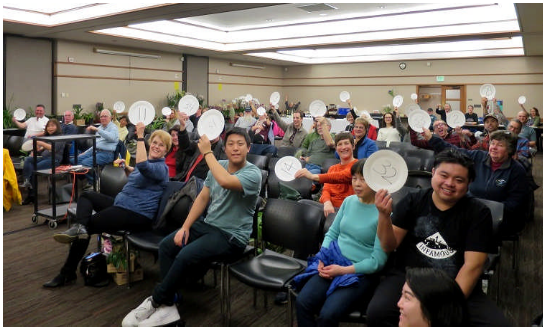
Now that's what I call an enthusiastic group of bidders!