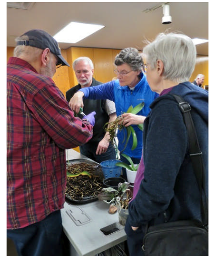
next we snip