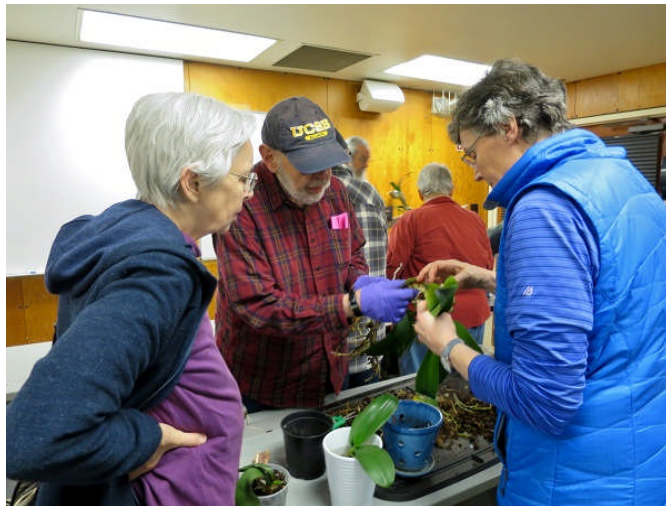
first we clean and examine