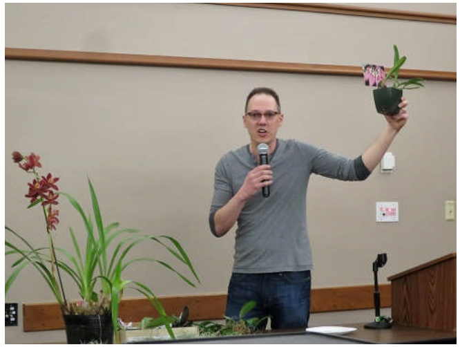
Joe can be very persuasive