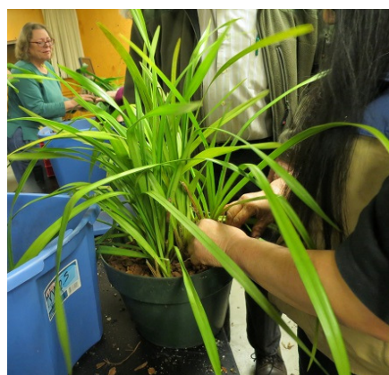
After spending a long time working on the plant, finally a piece of that big boy gets a pot