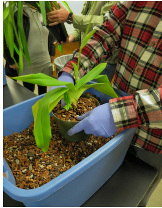
Packing potting material securely around the roots