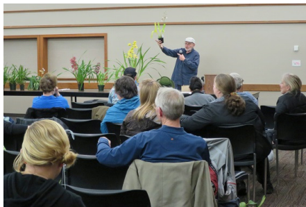
It was nice for the bidders to have so many plants in bloom to pick from