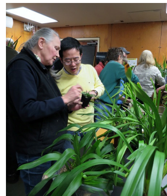
Checking a tiny orchid in a room full of overgrown cymbidiums