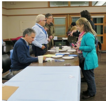
Happy to pay up at the end of a great event