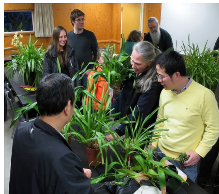
Offering advice that comes from years of experience