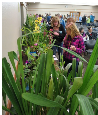
Previewing the plants