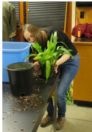
Tucking potting media all around