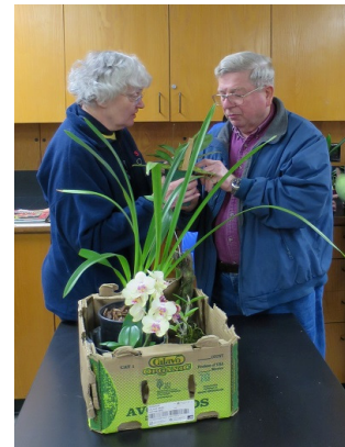
Inspecting before acting