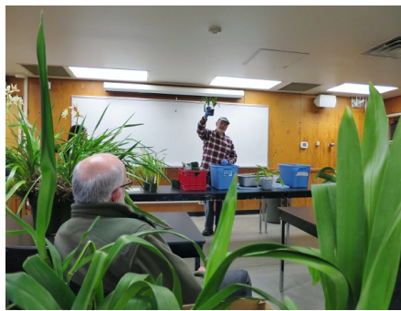
In the end we have a smaller piece in a correctly sized pot