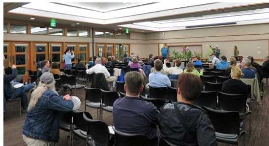
Entire room is full of eager bidders