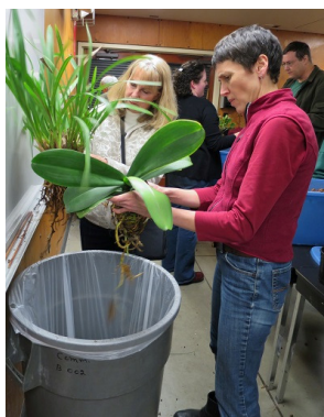
Cleaning old media off the roots