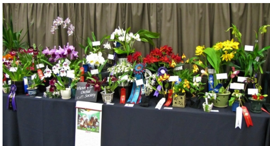
Victoria Orchid Society's display