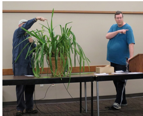
Bidder on the right, we'll see you next week at the Potting Clinic