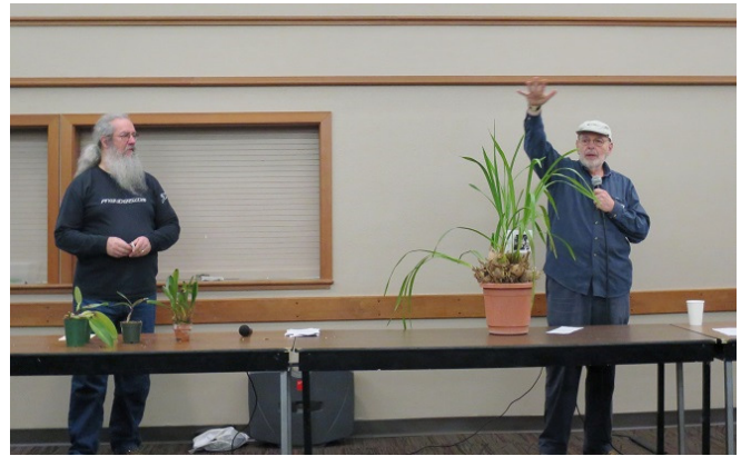
Do I hear a bid?