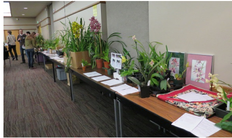
An orchid quilt and some artwork were also auctioned off