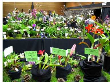
room full of orchids