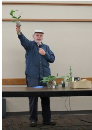
Let's get the bidding started