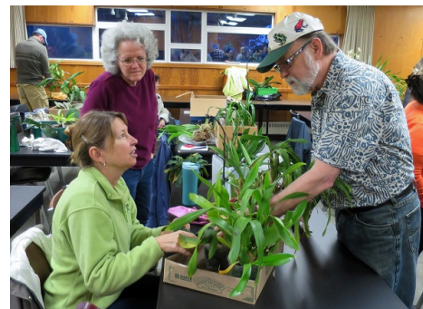
Experienced NWOS members then go around the room giving people a chance to ask questions