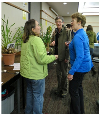
Friends catch up and have fun talking orchids