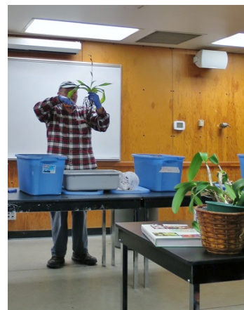
Cutting dead roots