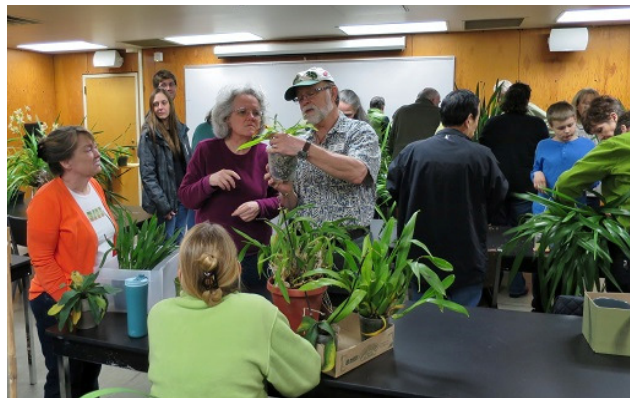
Checking each plant out