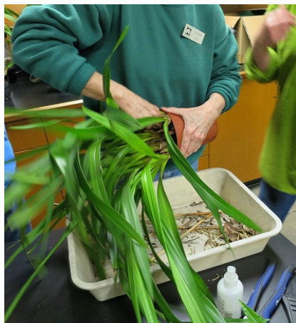
It took a long time and at least two people to pull this plant out of it's pot