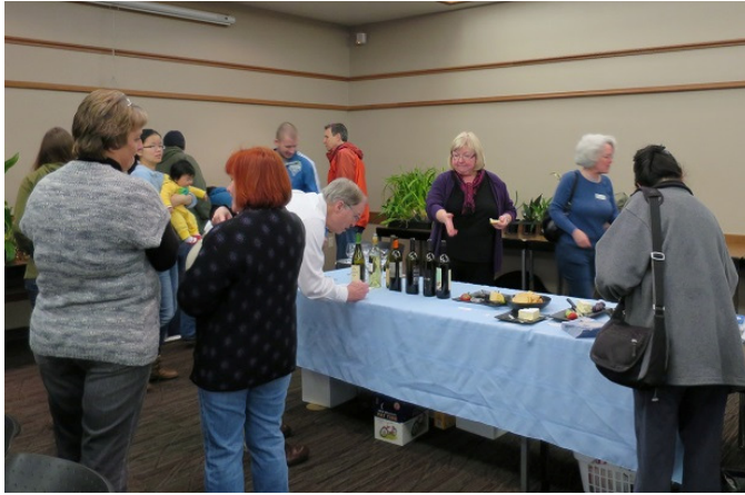
Offering some refreshments