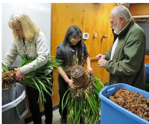
That's some cym!