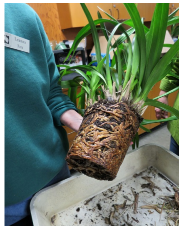
This mass of roots is why