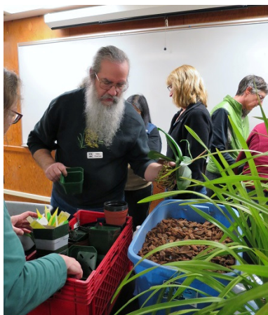
Helping to find the right pot