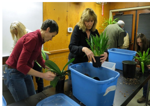
Potting the plants up