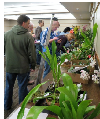
Hmmm, let me click on this and see what the web says about it