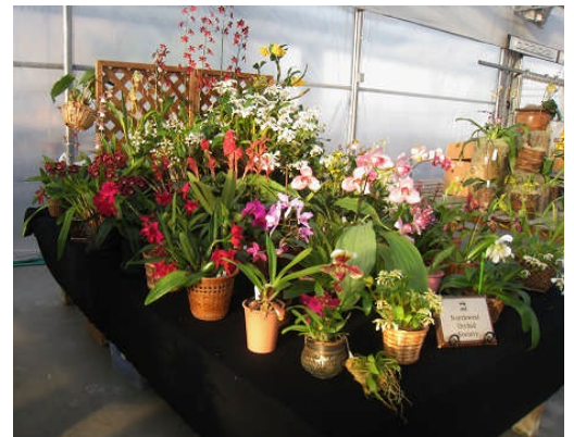
NWOS exhibit at the Mt Baker Orchid Society Show

The Mount Baker Orchid Society Show was held March 9-10 and as reported at the March meeting NWOS had a good-sized display for our friends to the north.