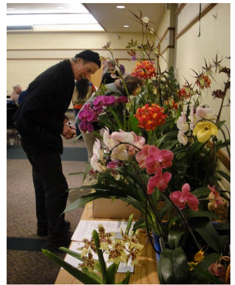
Hmmm, which one should I bid on?