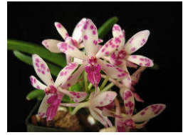
Neostylis Pinky 'Starry Night'