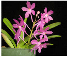
Ascofinetia Cherry Blossom 'Carmela'