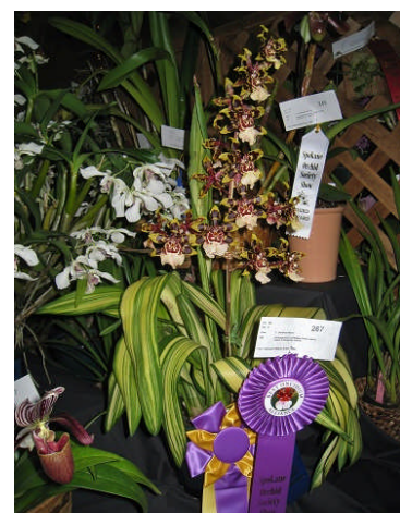
Colmanara Wildcat 'Green Valley' JC/AOS