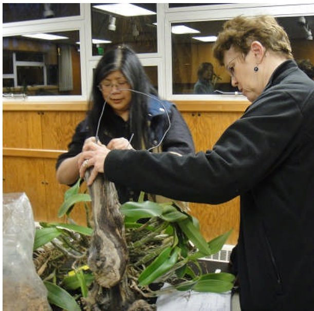
Mounting onto a natural branch was quite a process.