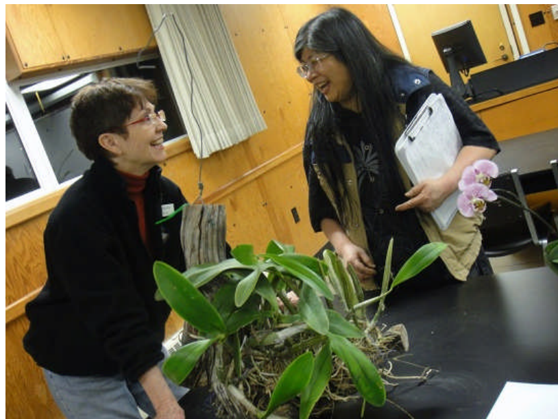
Sharing a humorous moment!