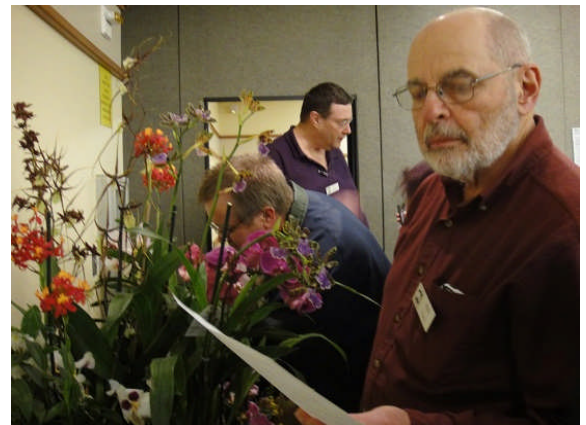
Giving the entries a discerning look

With a bidding plate in one hand and a drink in the other all we need to do is pick our favorites and let the bidding begin!