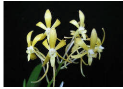
Ascofinetia Moonlight Firefly