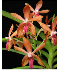
Nakamotoara Newberry Apricot