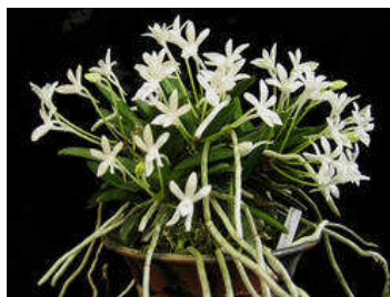
Neofinetia falcata 'Tomokongo'

University of Washington Center for Urban Horticulture 3501 NE 41st Street Seattle, WA 98105