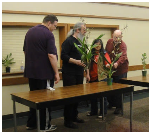
Our Auction team

With a bidding plate in one hand and a drink in the other all we need to do is pick our favorites and let the bidding begin!