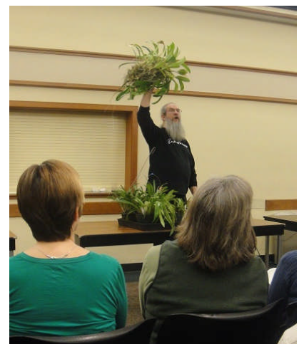
Who wants to bid on this big one?