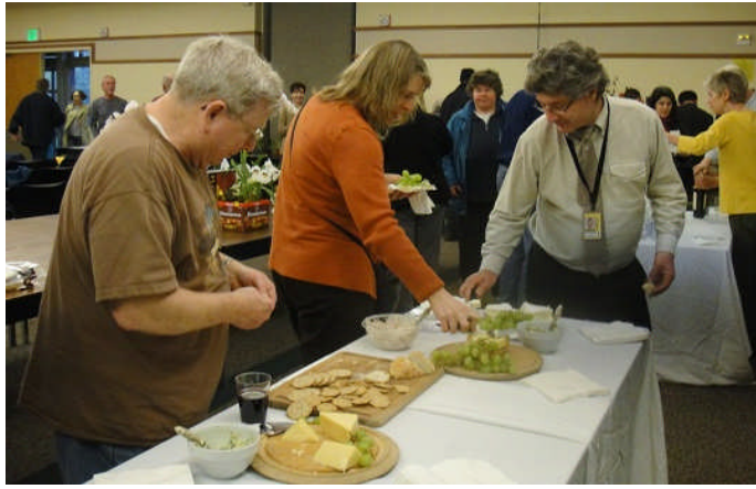
A great crowd enjoys the party