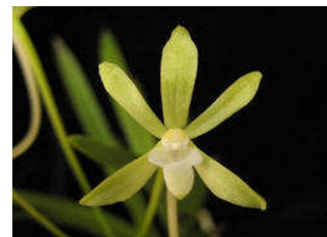
Neofinetia falcata 'Hisui'