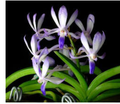
Neostylis Lou Sneary 'Blue Bird'