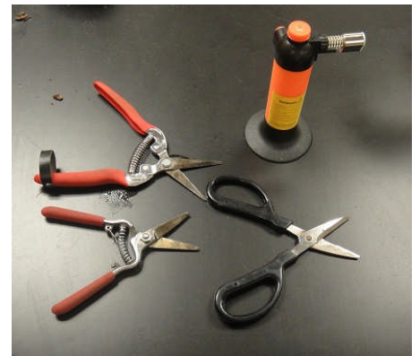
Basic Repotting Tools