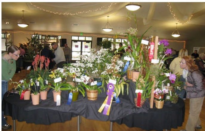
NWOS exhibit at the Spokane Orchid Society Show