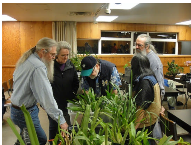
So many plants growing out of their pots need a whole team to assist.