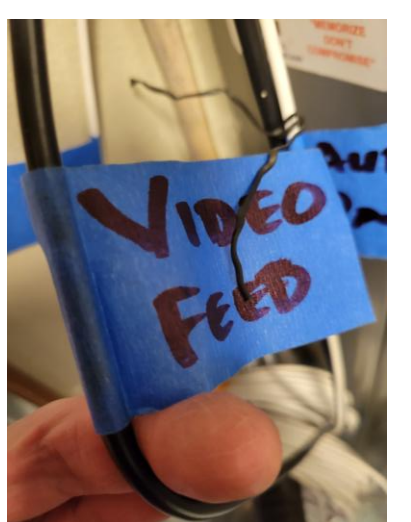
Cable for USB audio as presently marked