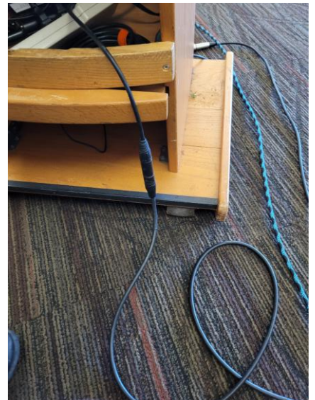
Podium mic connection at podium

Below is the feed from the panel to the podium mic which is fixed at the podium. That mic is not as directional and will be used for the presenter with the laptop on the podium. The laptop will use the camera on it for the Zoom meeting and that will also be used to share a screen. The shared screen is for Zoom participants and the meeting room to be viewed during presentations.