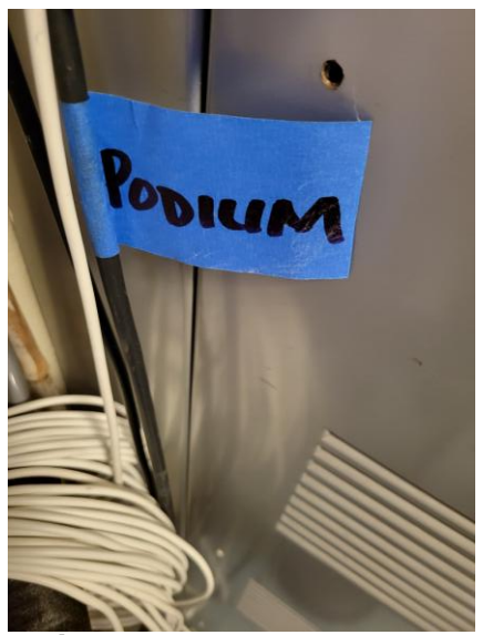
Podium cable marked at panel

Although most things are marked well, the "video feed" cable is really the USB cable for the audio to be connected to the laptop USB input.