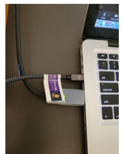
USB connection at laptop on podium

If you choose to use a separate mic in addition to the podium mic, the one with the blue tape is recommended by the Center. It has an indicator for battery strength when first turned on and a green light to indicate it is operable. On the right is enlarged to show the on/off switch.