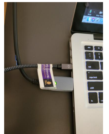
HDMI video connector on top. USB audio on bottom with green light.